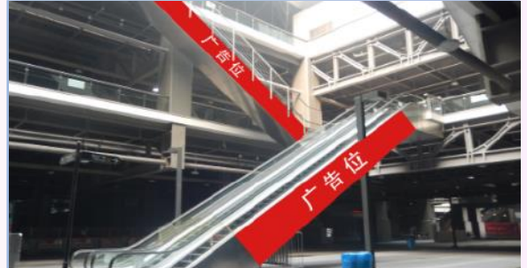
C02 Escalator advertisement - West Skylight

Specification: 3m (H) x 6m (W) Price: USD 2,900 / RMB 20,300