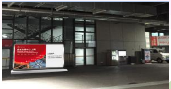
C04 Lightbox along drive way against wall on 0m/F

Specification: (a) 3.6m (H) x 3.4m (W) (1 Unit) (b) 3.6m (H) x 3.4m (W) (1 Pair) Price: (a) USD 2,000 / RMB 14,000 (b) USD 3,800 / RMB 26,000