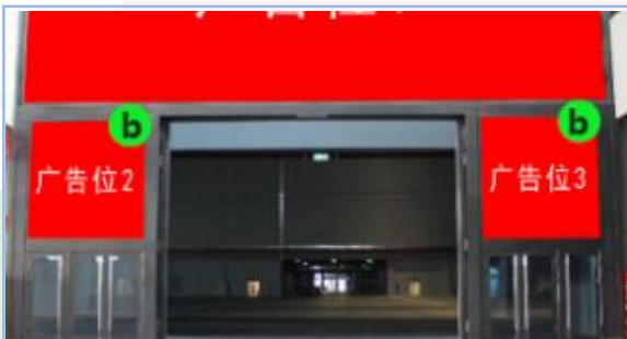
C03 Glass wall advertisement - Main entrances on 0m/F

Specification: 1.5m (H) x 15m (W) Price: USD 3,000 / RMB 21,000