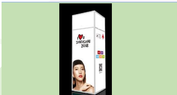
C08 Rectangular lightbox (New)

Price: (a) USD 7,200 / RMB 50,400 (b) USD 4,800 / RMB 33,600