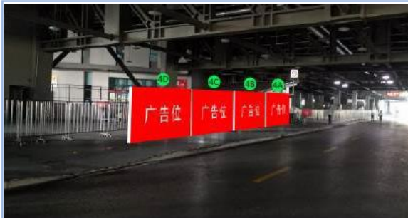
C01 Billboard - Metro station exit no. 4 / 5

Specification: 3m (H) x 6m (W) Price: USD 2,900 / RMB 20,300