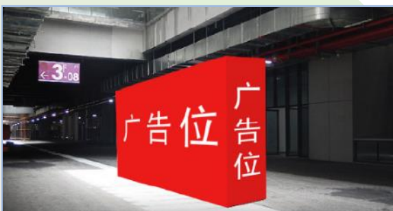
C05 Advertisement panel along drive way on 0m/F (4-side)

Specification: 2.2m (H) x 4m (W) Price: USD 1,200 / RMB 8,400