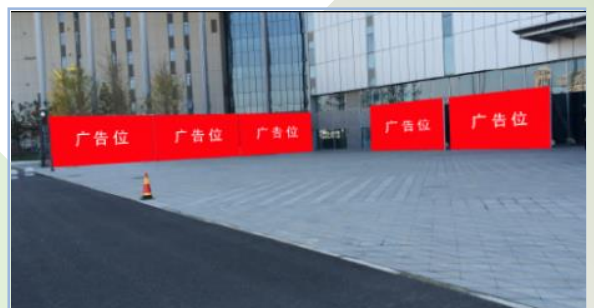
C06 Billboard - North Square

Specification: Front, back - 4m (H) x 8m (W) Price: Lateral side - 4m (H) x 2m (W) USD 12,000 / RMB 84,000