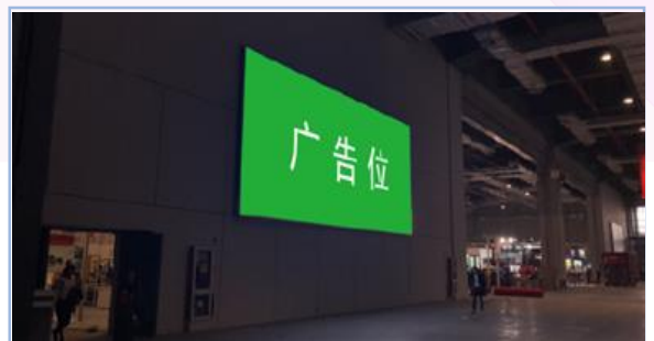
C09 Lightbox on hall partition (New)

Specification: 2.34m (H) x 0.91m (W) (4 side) Price: USD 3,000 / RMB 21,000